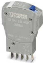
Thermomagnetic device circuit breaker, 1-pos., tripping characteristic M1 (medium-blow), 1 PDT contact, plug for base element.

Please be informed that the data shown in this PDF Document is generated from our Online Catalog. Please find the complete data in the user's documentation. Our General Terms of Use for Downloads are valid ( http://download.phoenixcontact.com )