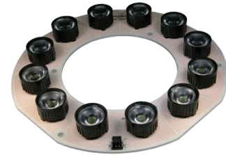
OPA741_ (23° Beam Angle)