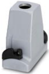
HEAVYCON ADVANCE EMV sleeve housing B10, with bayonet locking, height 100 mm, with 1x M32 thread, straight cable outlet

Please be informed that the data shown in this PDF Document is generated from our Online Catalog. Please find the complete data in the user's documentation. Our General Terms of Use for Downloads are valid ( http://download.phoenixcontact.com )