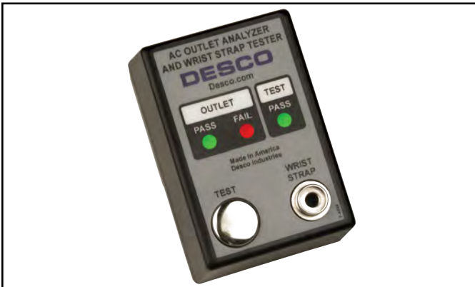
Figure 2. Desco 98131 AC Outlet Analyzer and Wrist Strap Tester

Use the AC Outlet Analyzer and Wrist Strap Tester to fulfill the S6.1 Section 6.3.1 requirement. “The hot, neutral, and equipment grounding conductor shall be verified to be in the proper wiring orientation in accordance with the National Electric Code (ANSI/NFPA-70).” (Grounding ANSI/ESD S6.1 section 6.3.1 Equipment Grounding Conductor)