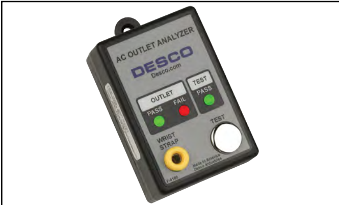
Figure 1. Desco 98132 AC Outlet Analyzer and Wrist Strap Tester